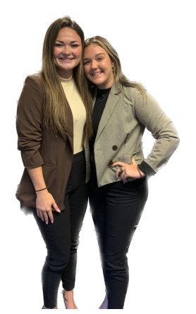
Fall 2022 State Farm Marketing and Sales Competition

At the Middle Tennessee State University Center for Professional Selling, we believe that true growth results from determination, dedication, and the pursuit of excellence. Our students have consistently demonstrated their exceptional abilities and commitment to excellence in various external competitions, highlighting their skills and making us incredibly proud.