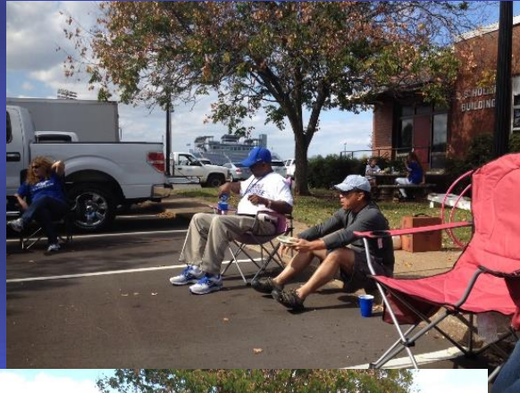
Facilities services Team Members (7 Departments) and Families Tailgated for Homecoming