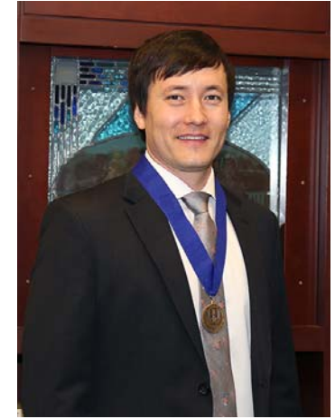
Robert Owen Biology