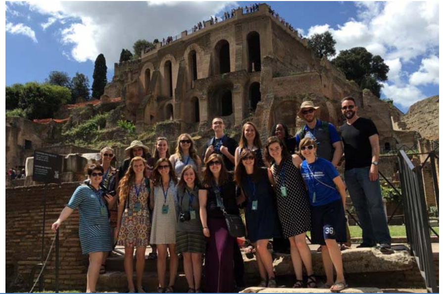
Italy, Thailand, and Washington D.C.