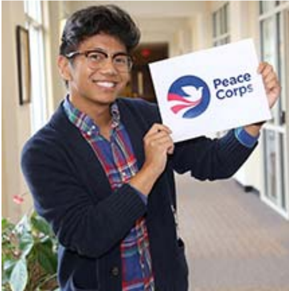
Hermon Phuntling Global Studies

Fulbright Thailand Peace Corp: Benin, Africa