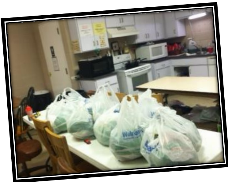
Fifteen turkeys were delivered to the Rooms at the Inn Shelter in Murfreesboro.

The Lambda Alpha Tau chapter of Phi Beta Lambda (PBL) sponsored its fifth annual community service project in November 2011. The chapter partnered with Rooms at the Inn, a homeless shelter in Murfreesboro, TN. Students were able to provide Thanksgiving food boxes and turkeys to over 15 needy families in the local community!