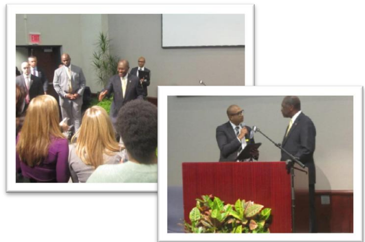
Businessman Herman Cain addresses students in conjunction with the Global Entrepreneurship Week events in December 2011.