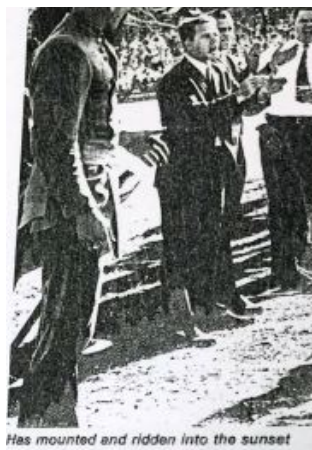
Has mounted and ridden into the sunset

Note: I would like to thank the staff of the Albert Gore Research Center ( https://www.google.com/url?sa=t&rct=j&q=&esrc=s&source=web&cd=1&cad=rja&uact=8&ved=0CB4QFjAAahUKEwi9purs88DHAhUBIO0KHQov_BAk&url=http%3A%2F%2Fgorecenter.mtsu.edu%2F&ei=oqDaVb3NKoGqNov-k0g&usg=AFOjCNGDYD3JwuOCEOnoatgyBBv9J7wH7g&sig2=bD3bBa904t27--Y3oSEycg ) at MTSU for their generous assistance in researching this article.