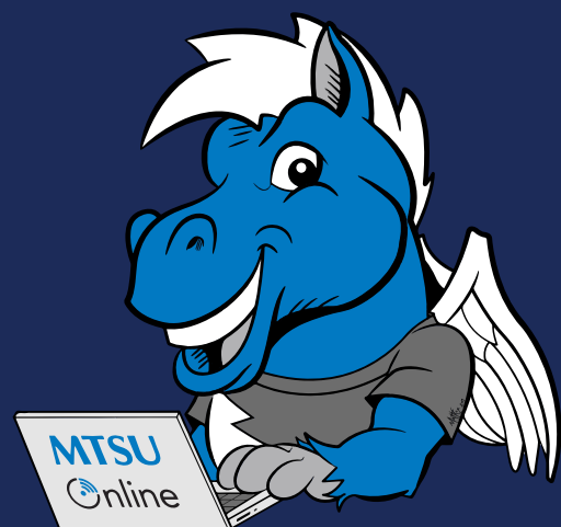
Image Sites and Copyright Information