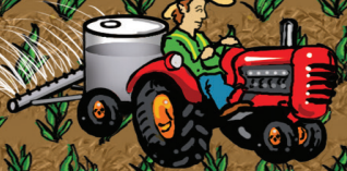
Prevent erosion with no-till or minimum tillage practices.