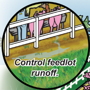
Control feedlot runoff.