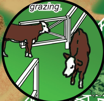
Use rotational grazing.