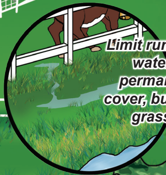
Limit runoff and reduce water pollution with permanent vegetative cover, buffer strips, and grassed waterways.