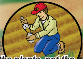
Feed the plants, not the soil; get manure/litter and soil tested in order to be able to calculate an appropriate application rate.