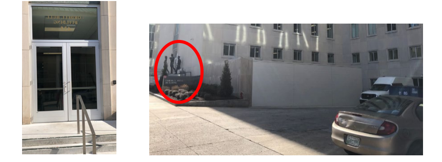
Figure 4. Entrance of Cordell Hull building, statues, & loading dock.

This big long link is for google directions to the Cordell Hull building. You might find that helpful. <u>https://www.google.com/maps/dir/36.1533014,-</u>86.7558949/Cordell+Hull,+425+5th+Ave+N,+Nashville,+TN+37243/@36.1469267,-86.7750132,13z/data=!4m9!4m8!1m0!1m5!1m1!1s0x886466f86b395987:0x24151d88e0f1f5ff!2m2!1d-86.7828914!2d36.167186!3e0