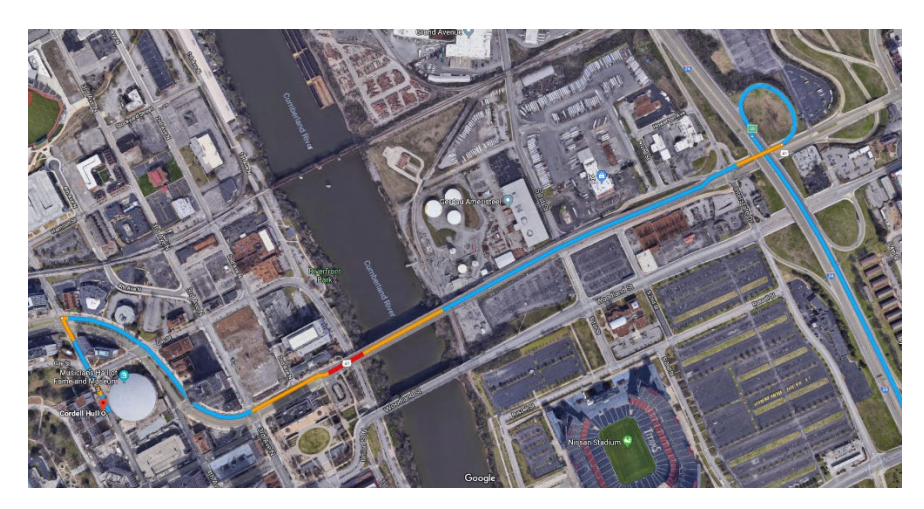
Figure 2. Closer View of Cordell Hull.